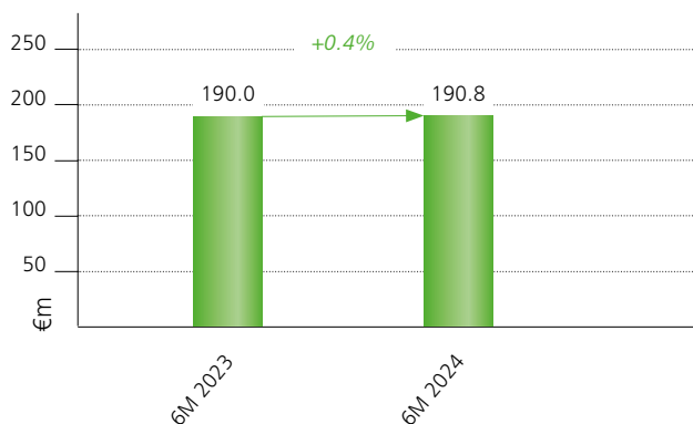
6M 2024 Revenue growth in € millions